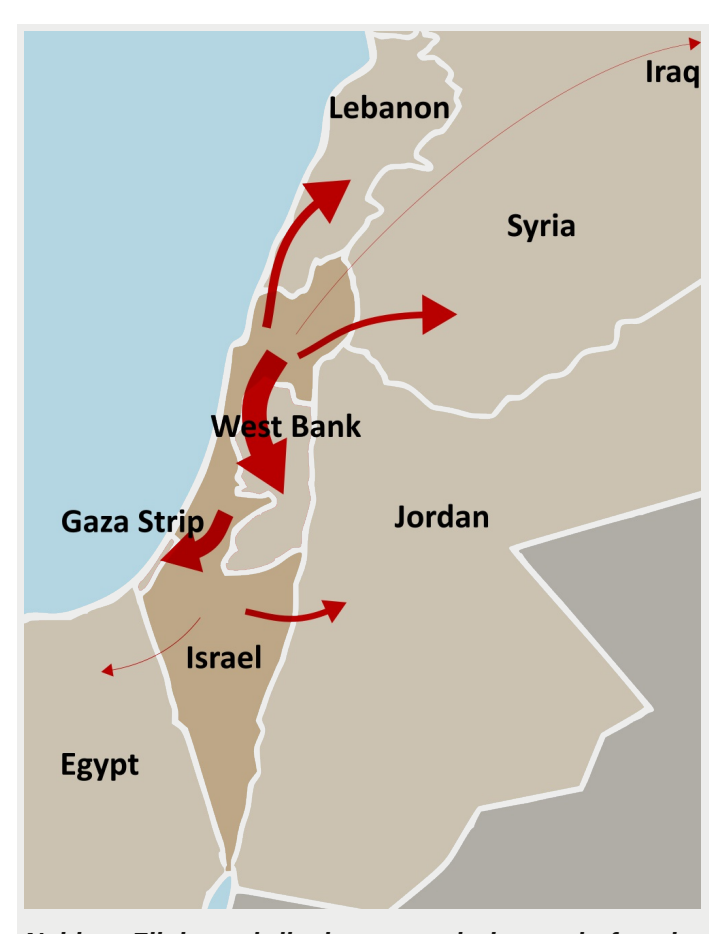
Nabka - Flight and displacement during and after the 1948 Israeli-Arab war:

Although the United Nations reaffirmed on June 4, 1967 the establishment of two states in Palestine, the cessation of Zionist settlement operations and the issuance of dozens of UN resolutions (more than 200 resolutions), the Zionist entity has remained in total disregard of all UN resolutions, with the support and protection of only one party. U.S. imperialism, using the veto power in the Security Council, but continues to suppress the resistance of the Palestinian people with iron and fire, the results of which have been until today millions of dead, wounded, displaced and detained, and the series of murders, imprisonments, settlements and destruction of the homes of the fa-