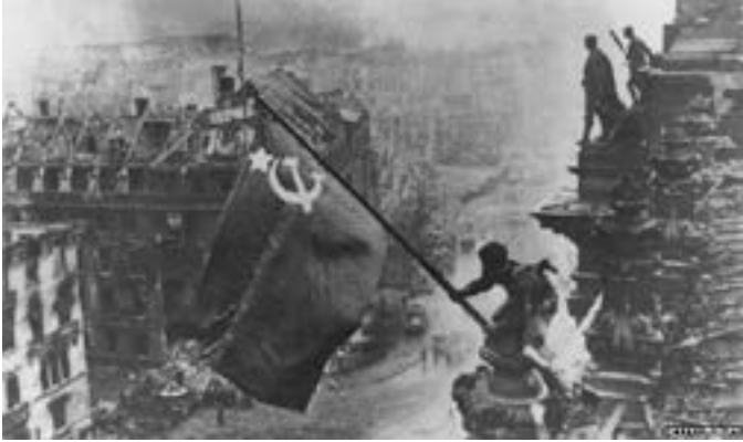
Soviet Red Army Victorious in Berlin

Hitler the absolute ruler of Germany for the next dozen years, during which the Nazi Regime was responsible for the extermination of perhaps one hundred million souls. Yet “the thousand year Reich” lasted just twelve years until the victorious and heroic Soviet Red Army marched into Berlin in May 1945.