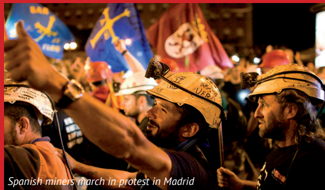
Spanish miners march in protest in Madrid

Donation account: MLPD, Deutsche Bank Essen Account No.: 210333101 Bank code: 36070024 Purpose: International Europe Seminar