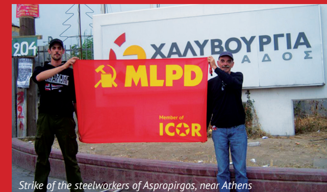
Strike of the steelworkers of Aspropirgos, near Athens